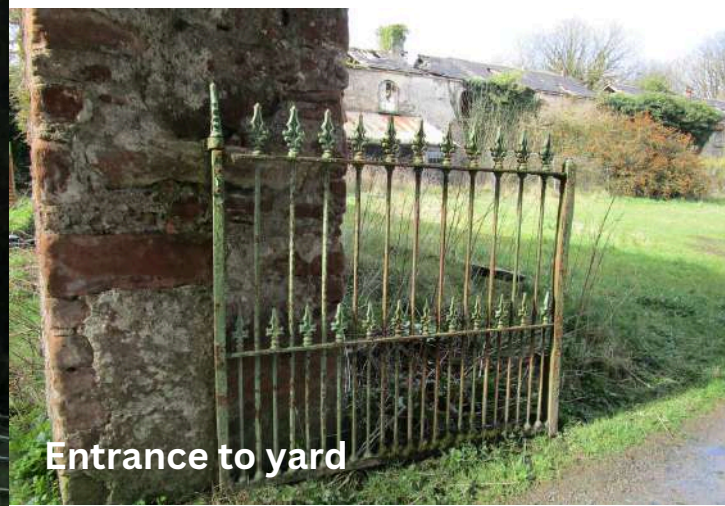
Entrance to yard

The great barn is sited adjacent to the yard wall, with the rear facing into the walled garden (as can be seen in the 1833 map & image below) and is now in ruinous condition. This is a small section of a much longer 2-storey building which runs the length of the yard. No interiors survive within this building. There is a gentle slope from the barn down to the path which runs through the yard and a further gentle slope down to the Turf House. The building measures c.10m x 6.5m, excluding the front lean-to which projects an additional c.3m.