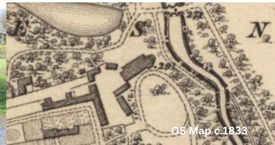
OS Map c.1833