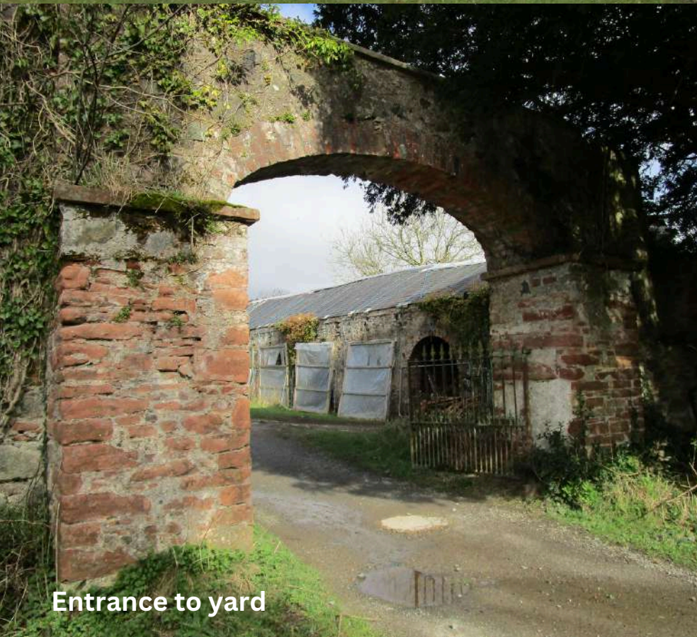
Entrance to yard

The Turf House is in ruinous condition. The front elevation features a series of arches (obscured by the plastic sheeting above). These arches are mirrored to the rear, although have been partially blocked up in the past. Internally a mezzanine floor has been added recently, to what was originally an open space, to reduce the risk of falling debris from the roof. The rear is currently obscured by vegetation, and is sited at the top of a slope leading down to the main house. This area had been cultivated as a garden, but is now overgrown. The building measures c. 37m x 8.5m. The distance between the turf house and barn (across the yard) is c.28m.