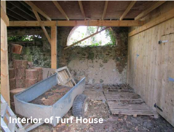
Interior of Turf House

The Turf House is in ruinous condition. The front elevation features a series of arches (obscured by the plastic sheeting above). These arches are mirrored to the rear, although have been partially blocked up in the past. Internally a mezzanine floor has been added recently, to what was originally an open space, to reduce the risk of falling debris from the roof. The rear is currently obscured by vegetation, and is sited at the top of a slope leading down to the main house. This area had been cultivated as a garden, but is now overgrown. The building measures c. 37m x 8.5m. The distance between the turf house and barn (across the yard) is c.28m.