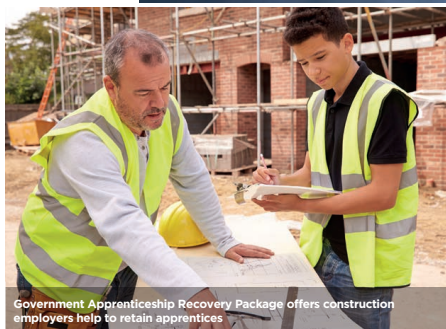
Government Apprenticeship Recovery Package offers construction employers help to retain apprentices

through to completion of their NVQ Level 2 and 3 on the ApprenticeshipsNI Programme. This funding is paid via the training provider.