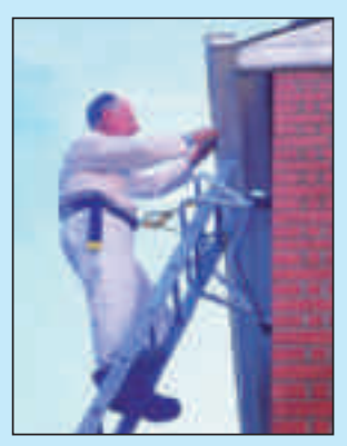
Microlite and ladder belt restraint in use