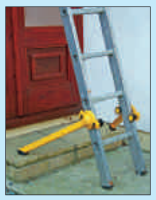
Use anti slip devises or stabilizing units