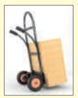
Other examples of lifting aids