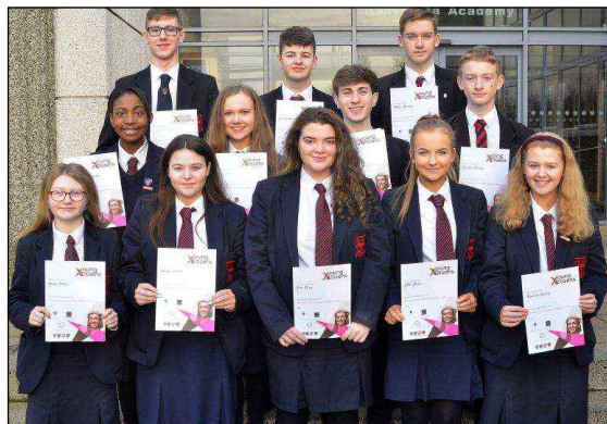
Ballymena Academy pupils who took part in the Bar Mock Trial in Londonderry Court House. GB0708D20