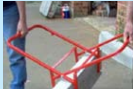
Use mechanical lifting aids whenever possible