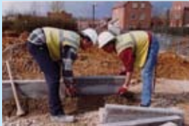
Don't lift this way – you are risking permanent injury