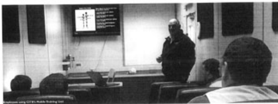
Employees using CITEV Mobile Training Unit