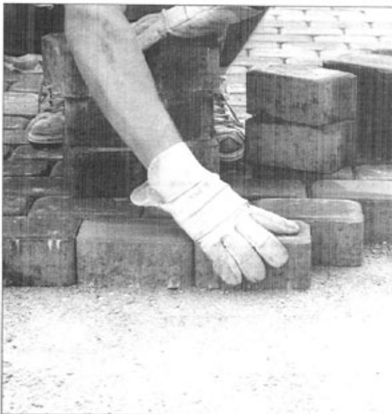
A series of events is aimed at helping the construction sector weather the economic storm

For further information on these dates, log onto www.citb-sni.org.uk .