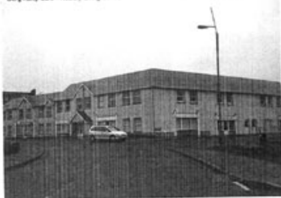
Derg Valley Care – Healthy Living Centre