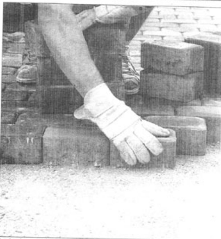
A series of events is aimed at helping the construction sector weather the economic storm

For further information on these dates, log onto www.citb-sni.org.uk .