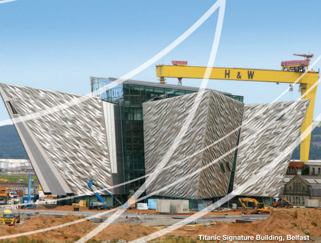
Titanic Signature Building, Belfast